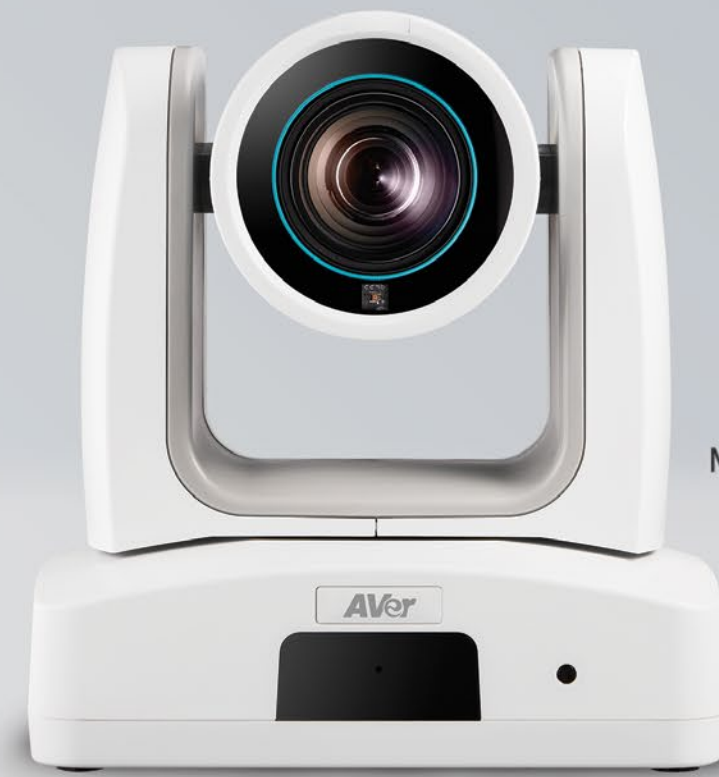
MD330U SKU: PAMD330UI 30X 4K Medical PTZ Camera