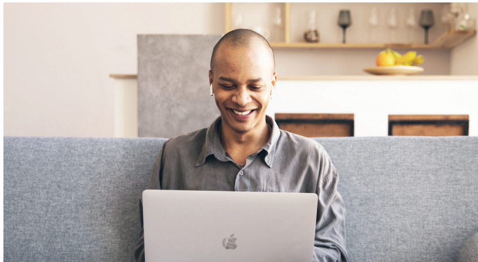
Modern intranets support Federal employees with the right technology to be productive wherever they are.

The intranet is also where employees communicate and collaborate with each other as well as with other stakeholders. This means it must be secure. It should not only protect against outside hackers, but also provide identity management and tailored information access that ensures only the right information is available to each individual employee.