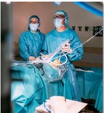
Health Care & Pharma