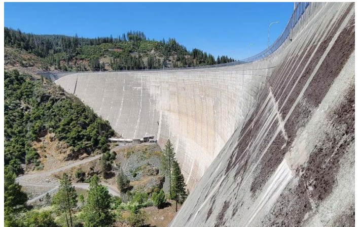
Yuba Water implemented a digital automated survey and monitoring system to better understand the entire performance of New Bullards Bar Dam, ensuring safe, reliable operations.

Moreover, the digital twin allows the team to closely monitor the structure, working toward the agency's ultimate goal of ensuring public safety and protecting the surrounding environment. Using iTwin IoT, the dam can be monitored more closely and quickly during heavy rainfall and seismic events. “For Yuba Water Agency, there is nothing more important than public safety. Investing in a real-time, automated total monitoring station at New Bullards Bar Dam significantly improves our monitoring capabilities and is testament to our continued commitment to public safety and infrastructure resilience,” said Truong.