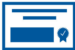
DoD 5015.02 certified